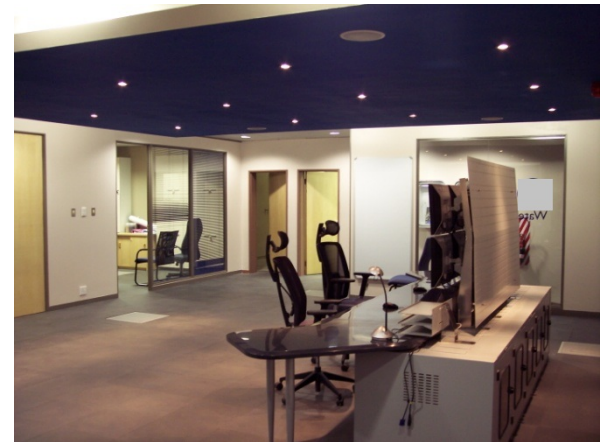
Control Room Layout

The installation work included numerous different disciplines and materials of construction including: