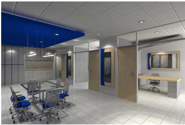
WTP Control Room Office Design